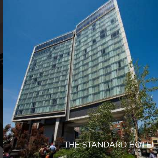
THE STANDARD HOTEL