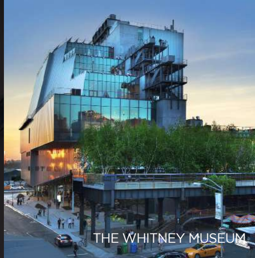
THE WHITNEY MUSEUM