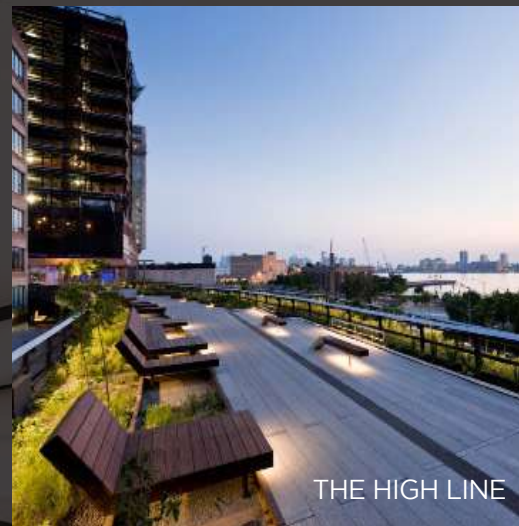
THE HIGH LINE