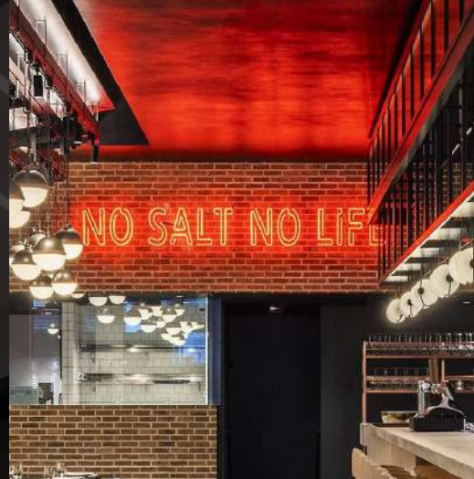
NO SALT NO LIFE