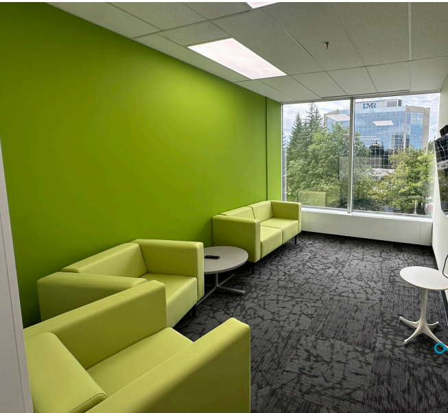
MULTIPLE LOUNGE AREAS