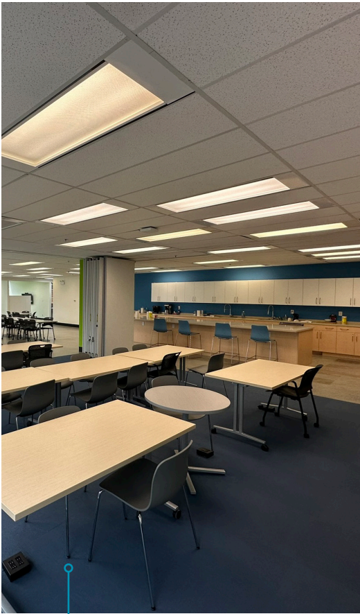
SPACIOUS COLLABORATIVE KITCHEN