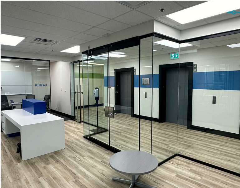
OPEN & BRIGHT RECEPTION AREA