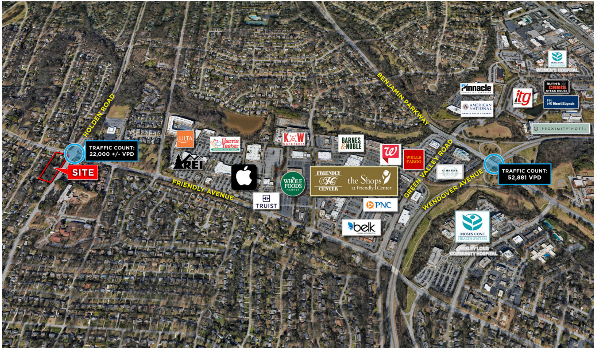
Aerial with Surrounding Amenities

3701 W. FRIENDLY AVE., GREENSBORO, NC 27410