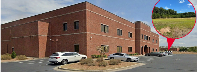
26,377 SF Building | 3.13 AC Excess Industrial Land