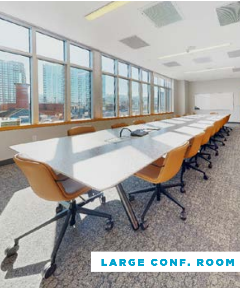
LARGE CONF. ROOM