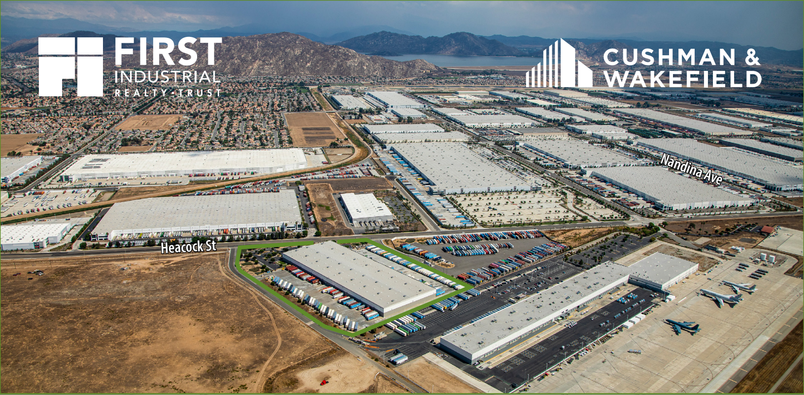
First Heacock • 16875 Heacock Street • Moreno Valley, CA