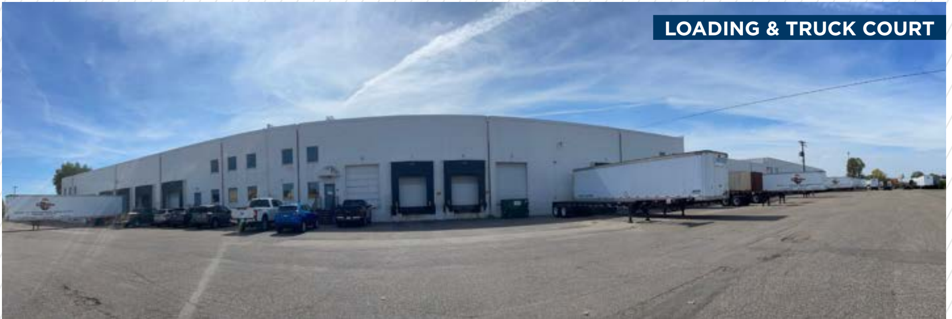
LOADING & TRUCK COURT