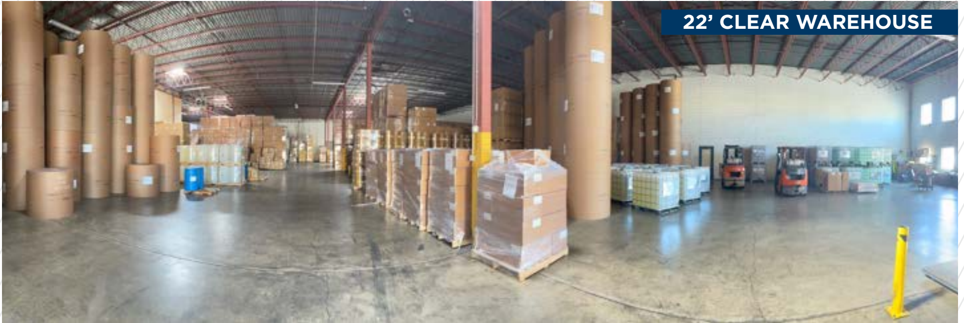
22' CLEAR WAREHOUSE