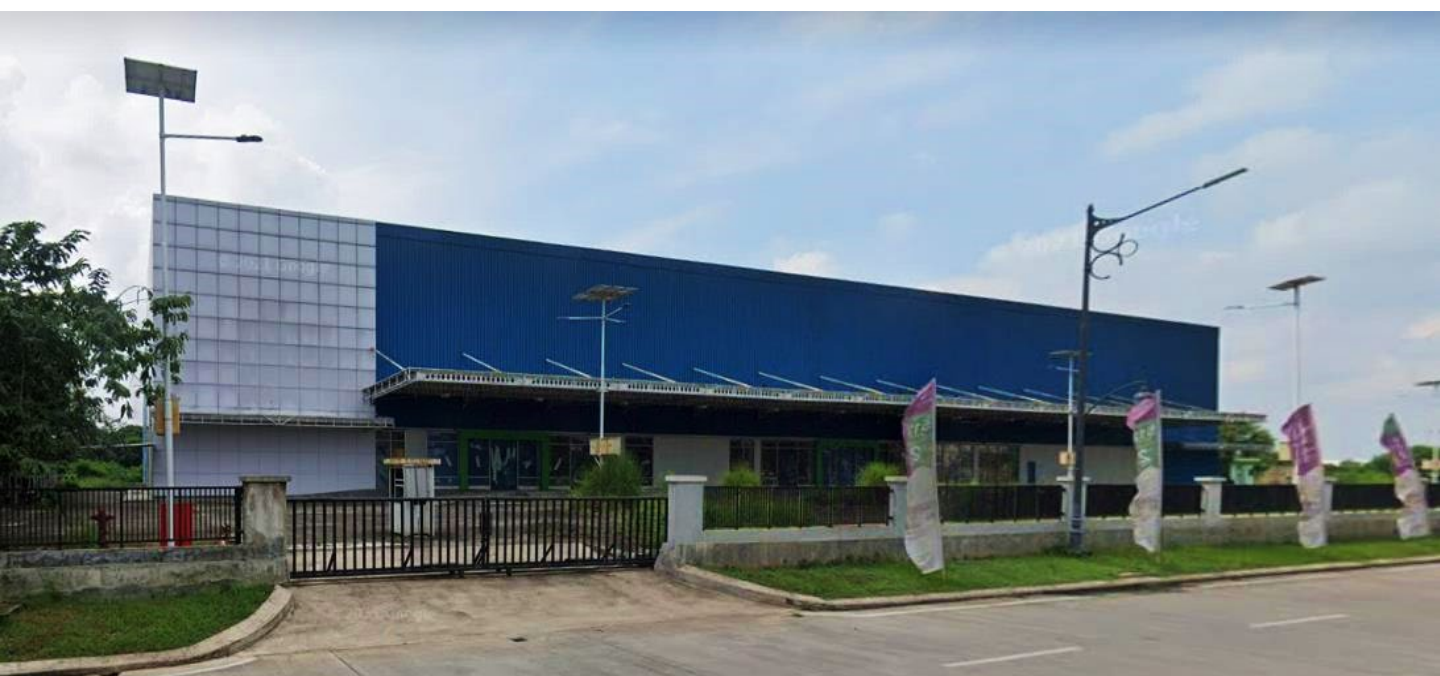
VIEW FROM JL. MOVIE LAND