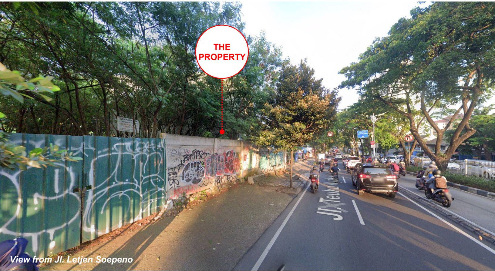
View from Jl. Letjen Soepeno