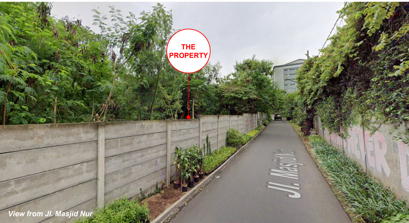
View from Jl. Masjid Nur