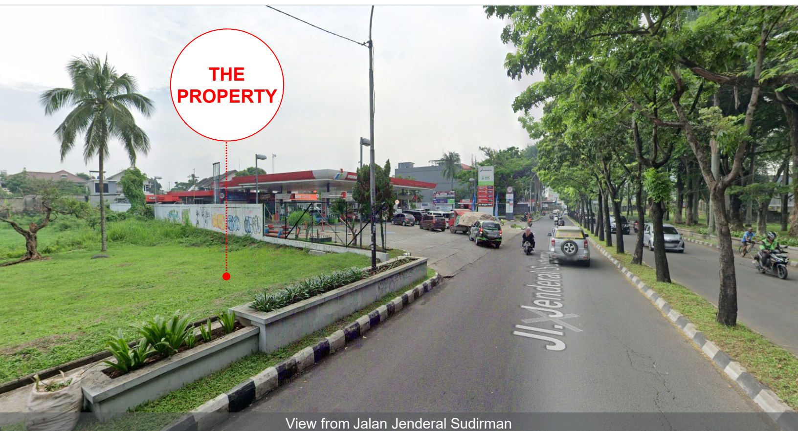
View from Jalan Jenderal Sudirman