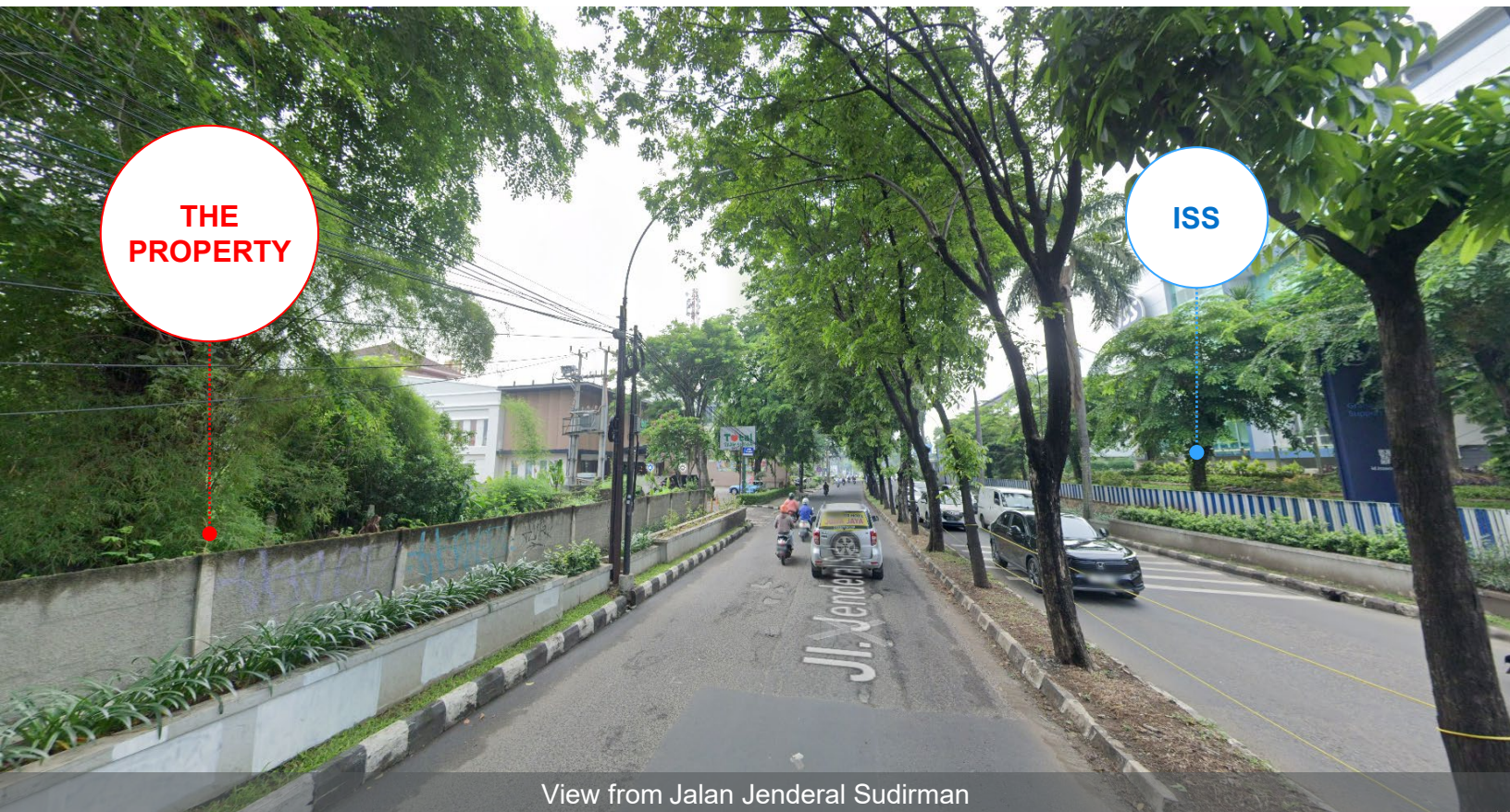
View from Jalan Jenderal Sudirman