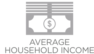
AVERAGE HOUSEHOLD INCOME