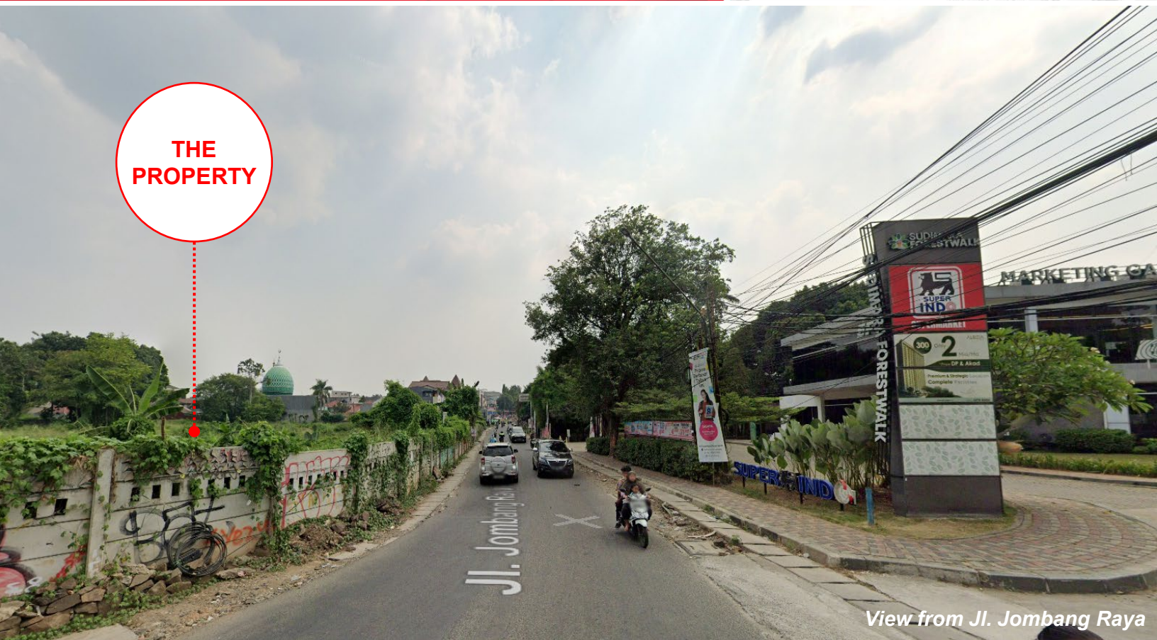
View from Jl. Jombang Raya