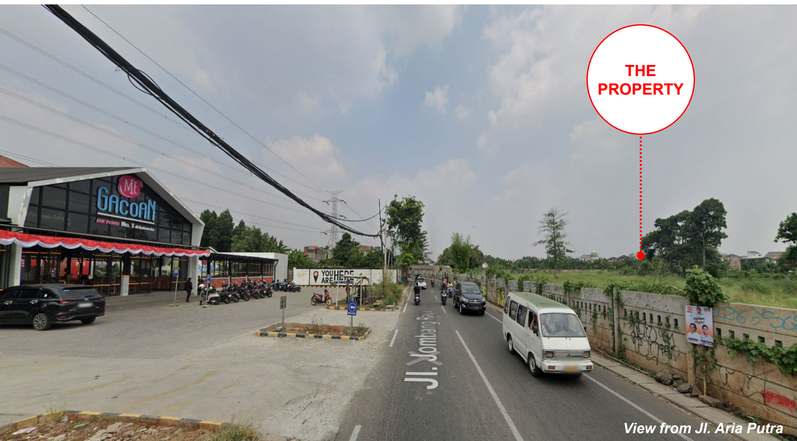
View from Jl. Aria Putra