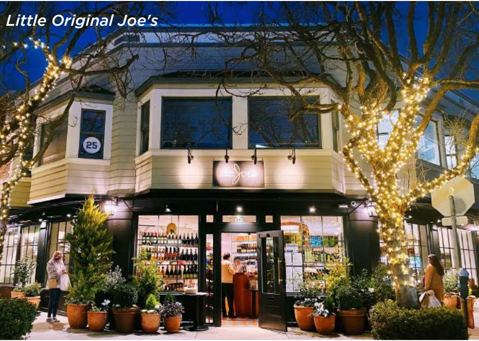
Little Original Joe’s

231 and 233 West Portal are on the southerly side of what is locally referred to as the “second block” of West Portal Avenue, between Vicente and 14th Streets. 1 block away is the West Portal Muni station, served by Muni train lines L Taraval, M Ocean View, S Shuttle, K Ingleside and T Third Street.