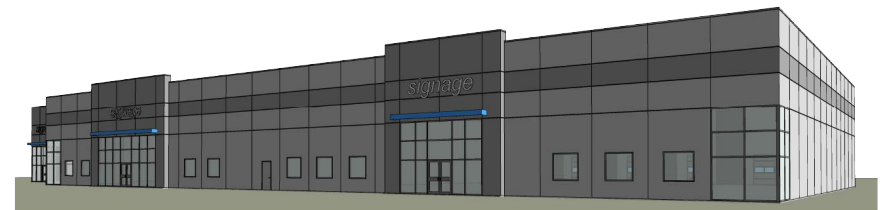
View from Southeast Corner