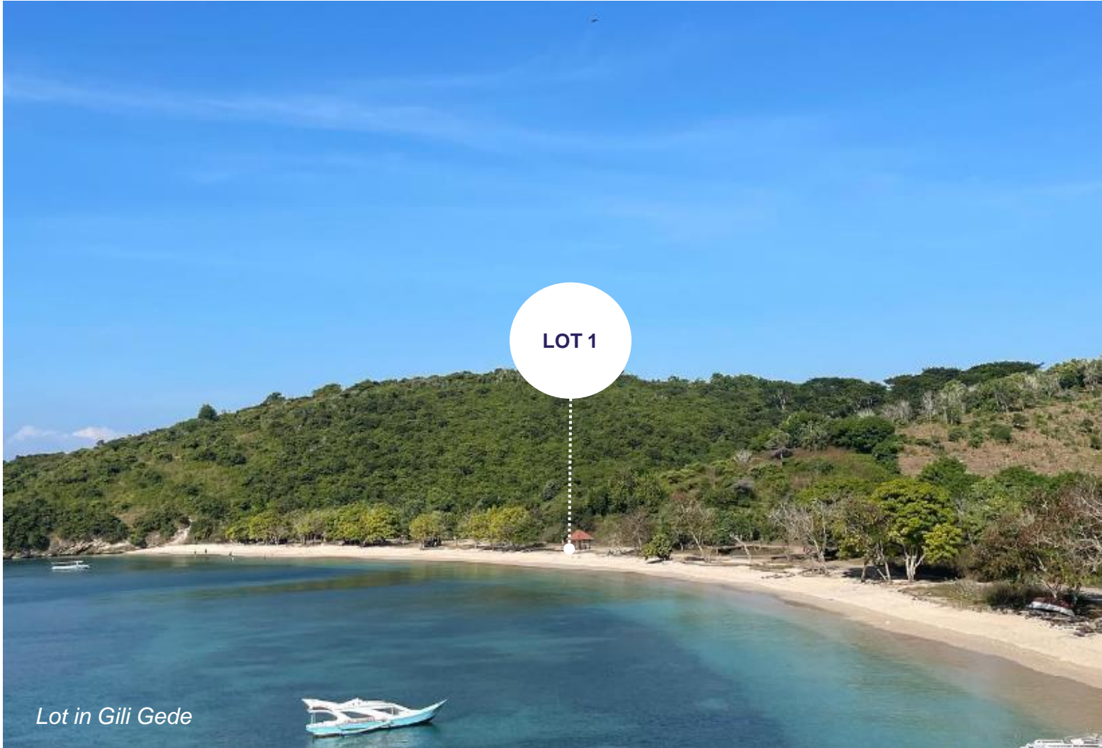
Lot in Gili Gede