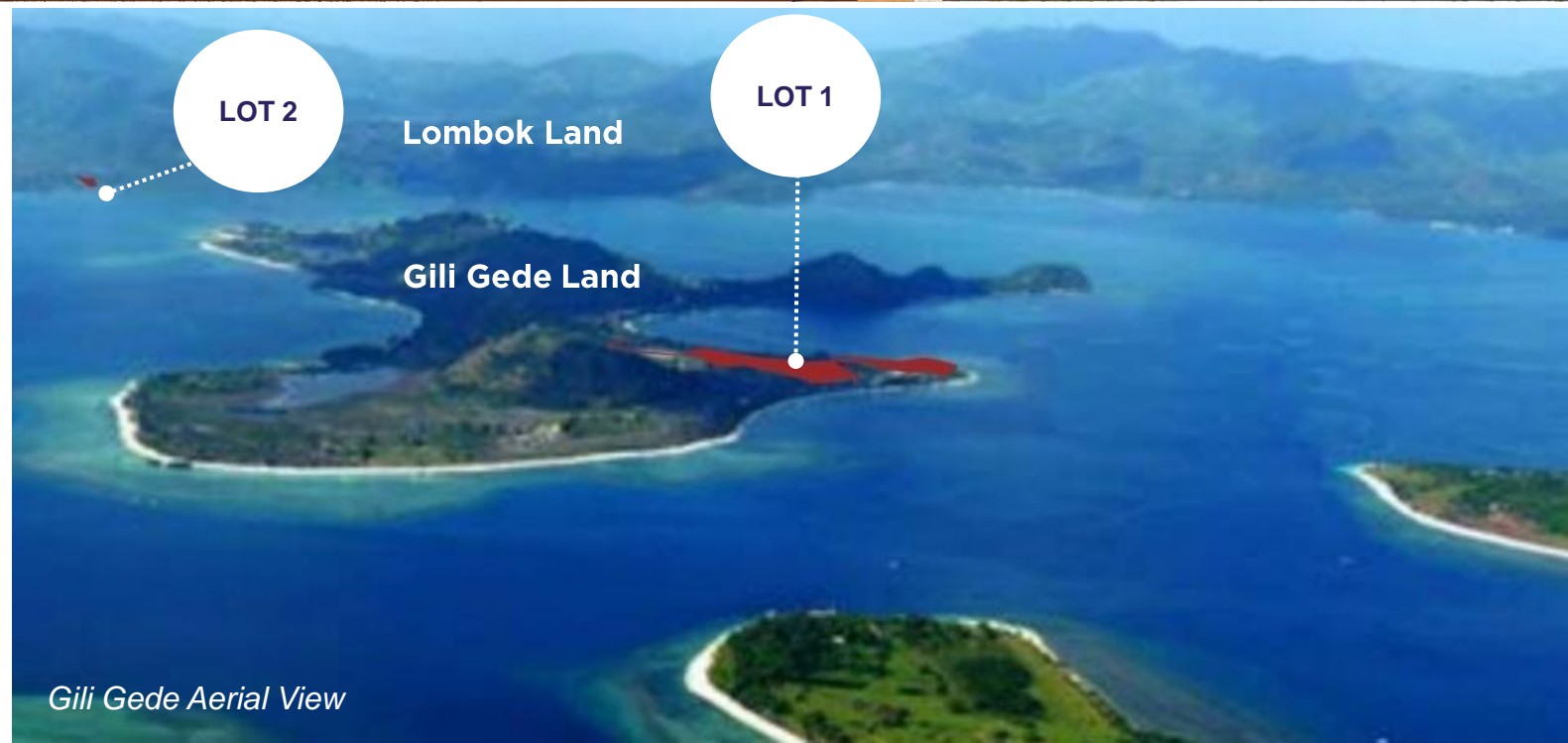
Gili Gede Aerial View