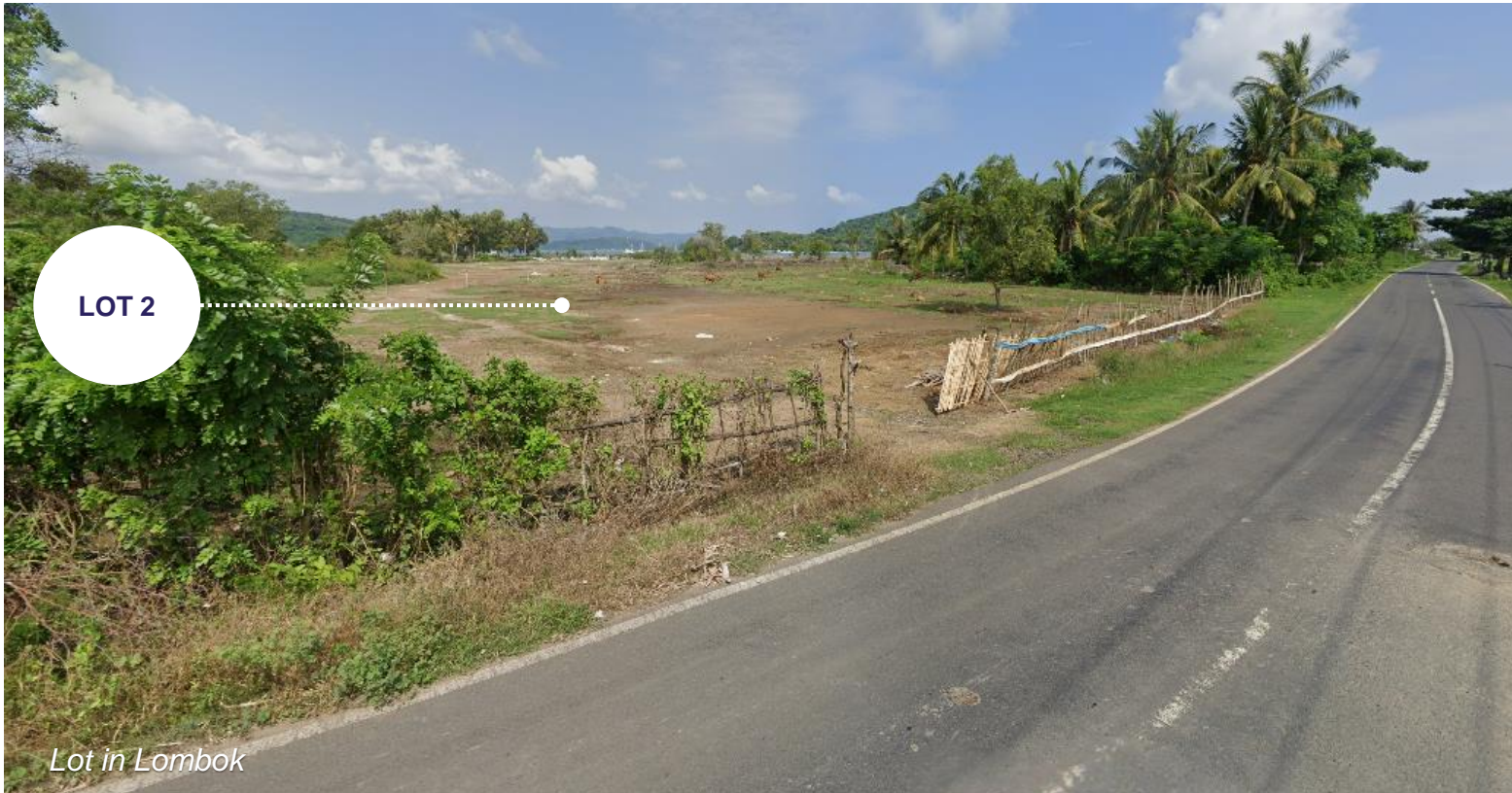
Lot in Lombok