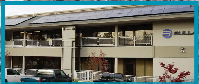
7447 ANTELOPE RD.