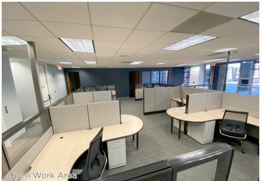
Open Work Area