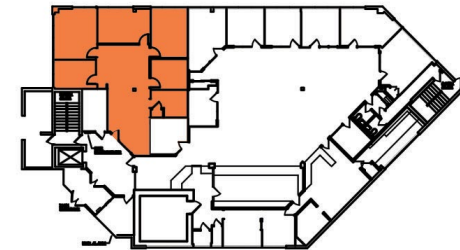
Key Plan - 1st Floor