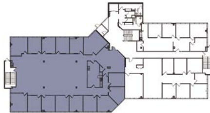
KEY PLAN - 1ST FLOOR

Senior Director aaron.barnard@cushwake.com +1 952 465 3372