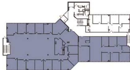
KEY PLAN - 1ST FLOOR

Senior Director aaron.barnard@cushwake.com +1 952 465 3372