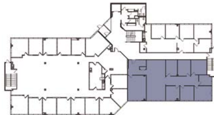
KEY PLAN - 1ST FLOOR