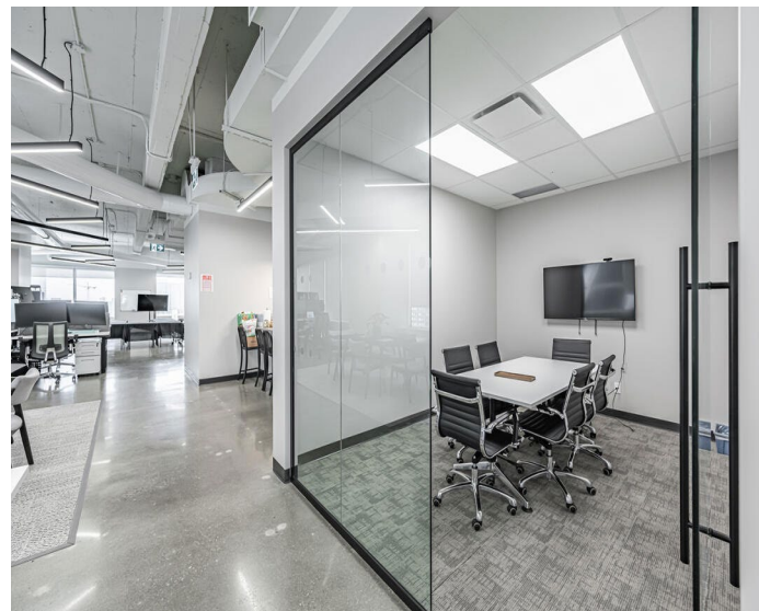
Images of interior premises