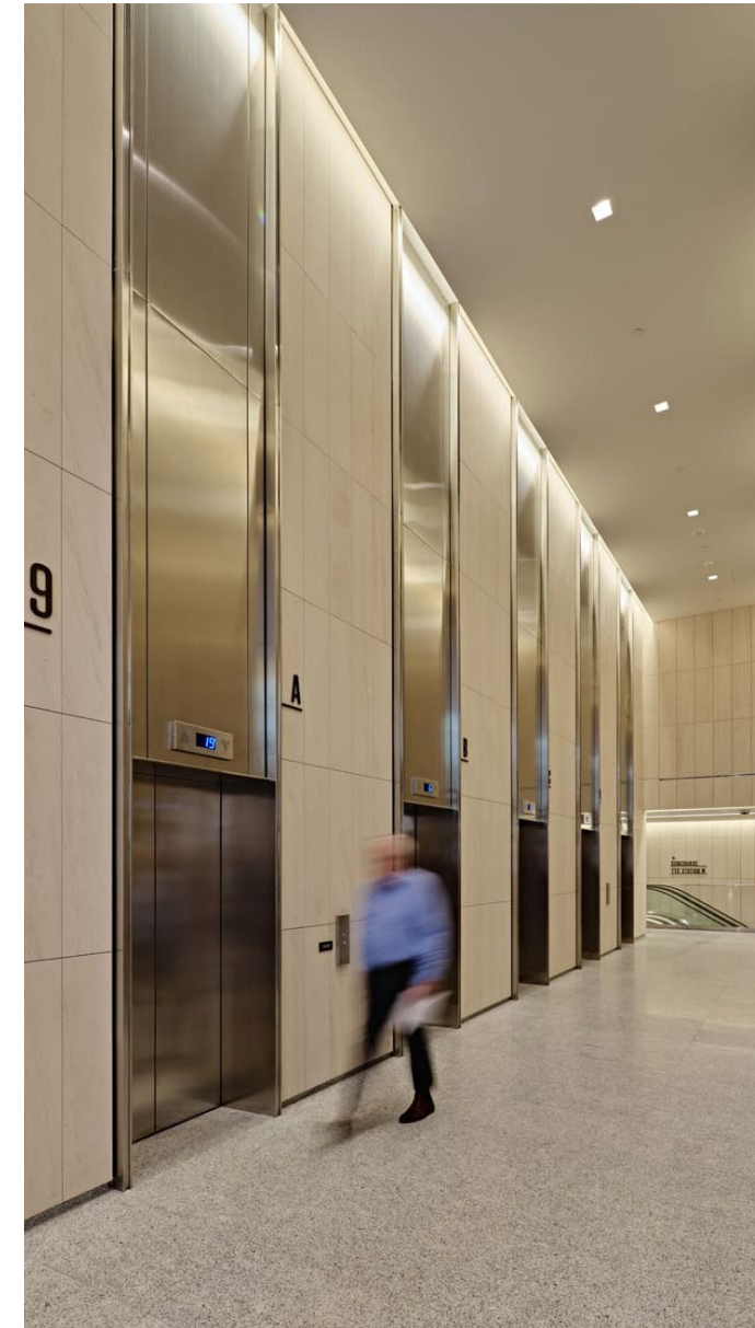
Newly Renovated Ground Floor Lobby