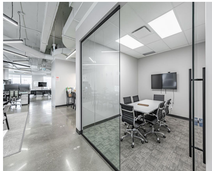
Images of interior premises