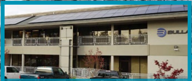
7447 ANTELOPE RD.