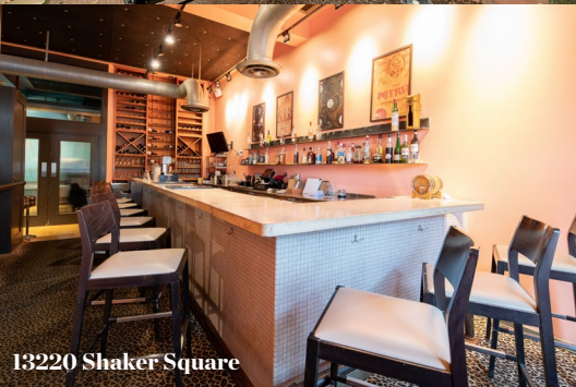
13220 Shaker Square