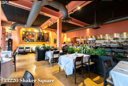
13220 Shaker Square