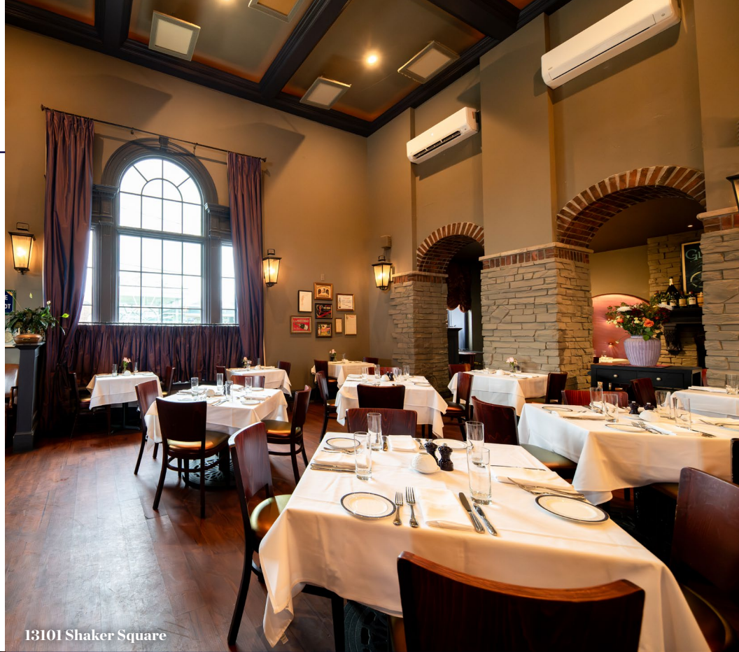
13101 Shaker Square