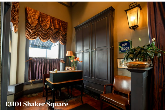
13101 Shaker Square