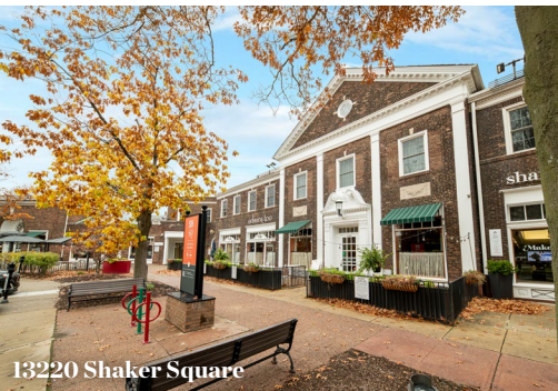
13220 Shaker Square