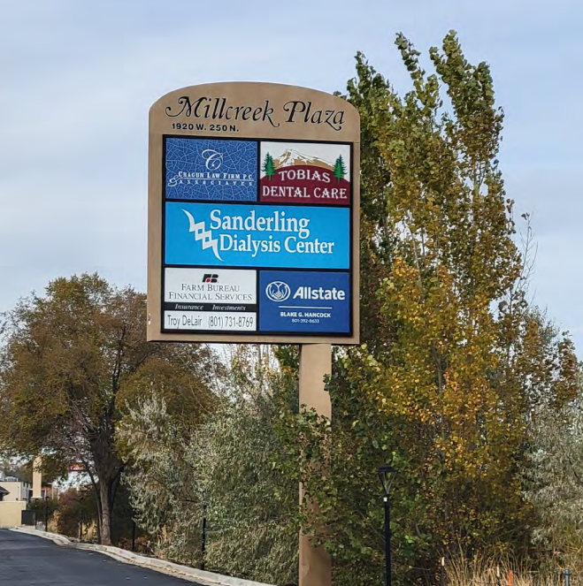
PYLON SIGNAGE WITH I-15 VISIBILITY