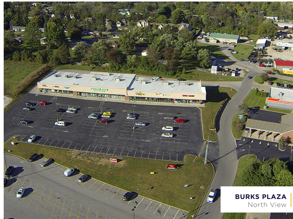
BURKS PLAZA North View