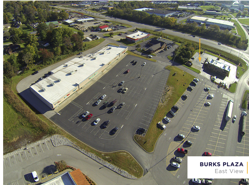
BURKS PLAZA East View