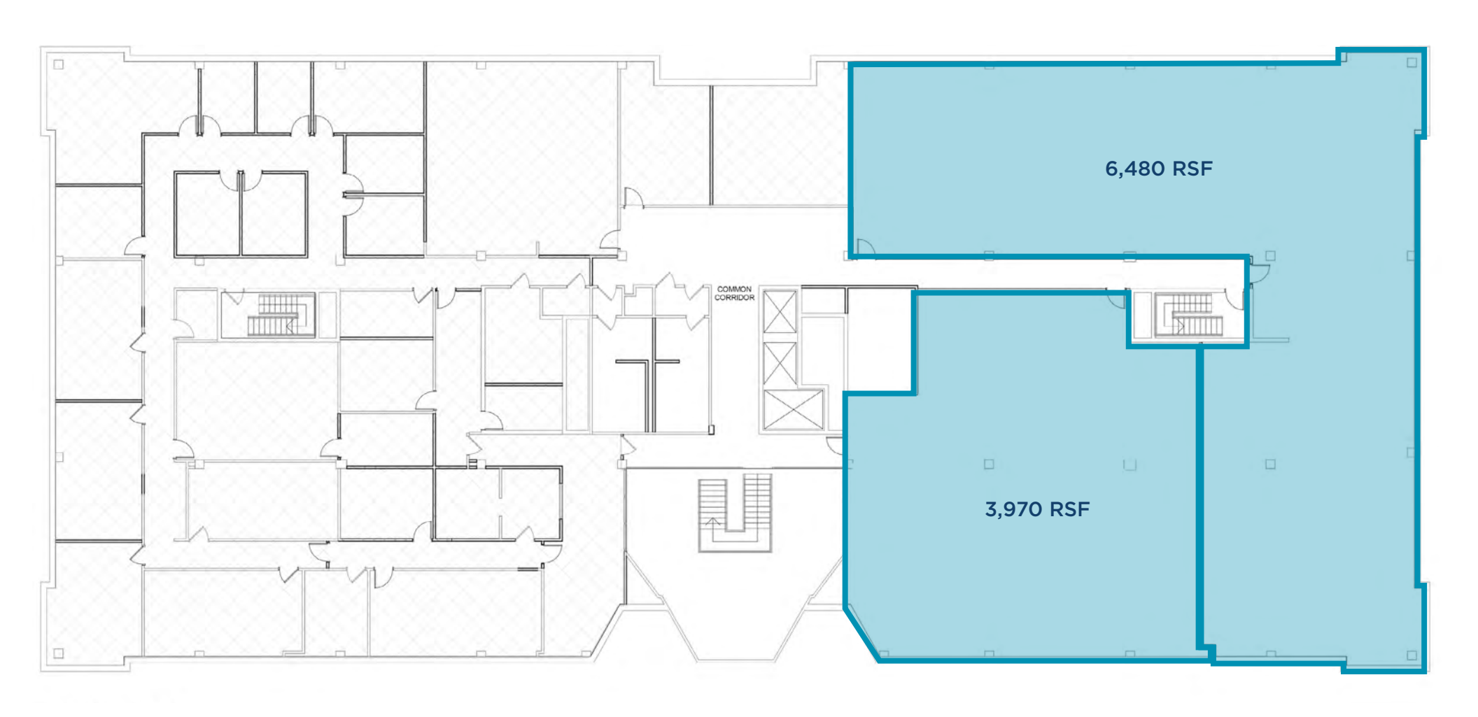
FOURTH FLOOR - 11,593 RSF TOTAL AVAILABLE RECENTLY (2020) REFURBISHED