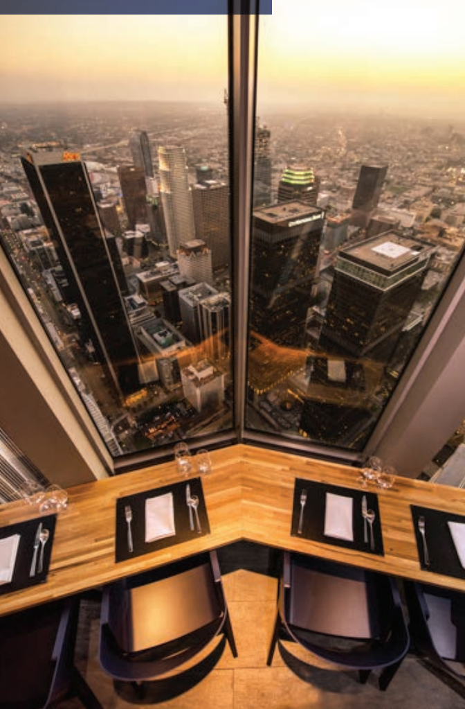
OBSERVATION DECK & PRIVATE EVENT SPACE ON FLOORS 69 & 70