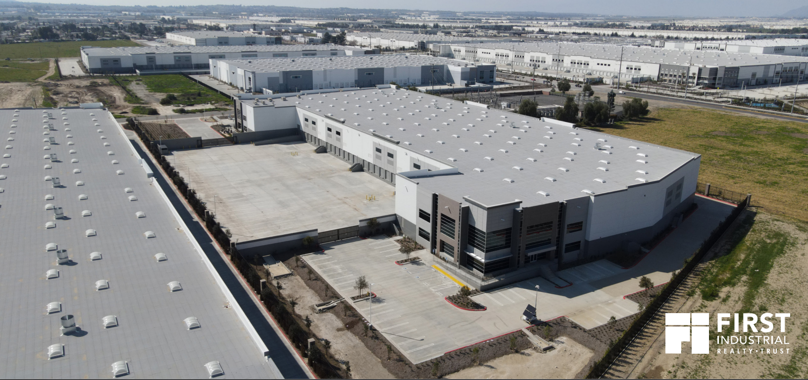
First Wilson II • 3175 Wilson Avenue • Perris, CA