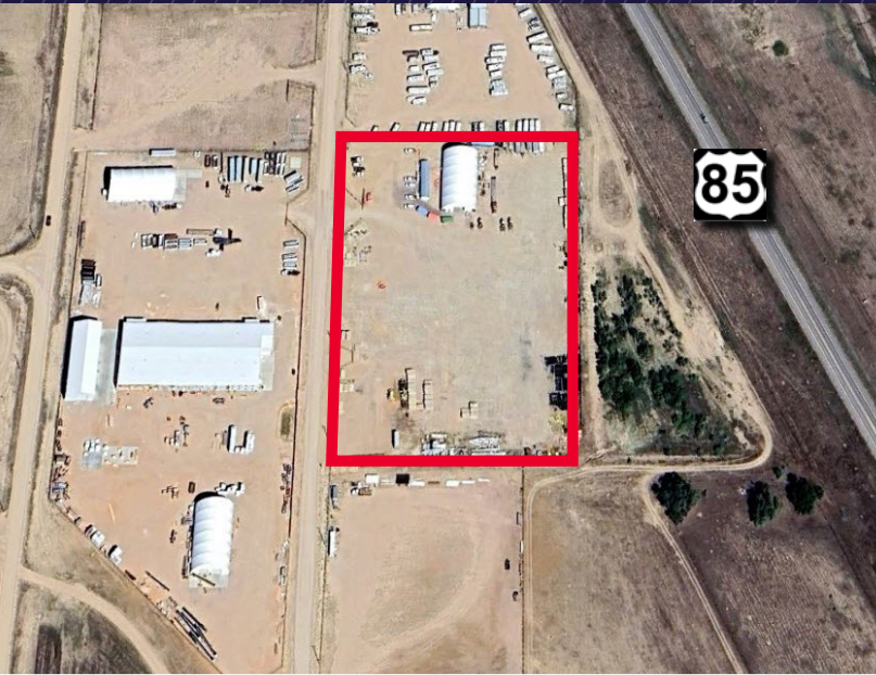
*Similar Quonset building shown