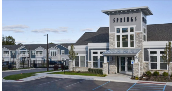
Authentix Apartments – 240 units