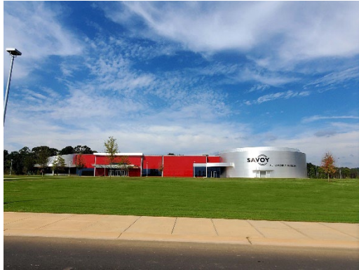
Savoy Automobile Museum