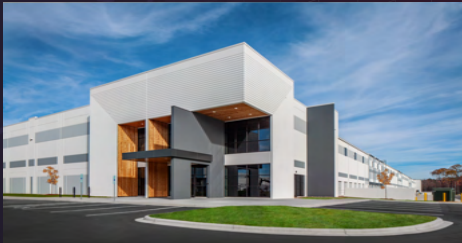
INNOVATION LOGISTICS CENTER