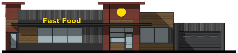
Bldg 1 East Elevation