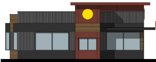
Bldg 1 South Elevation