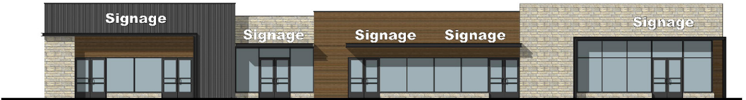
Bldg 2 South Elevation