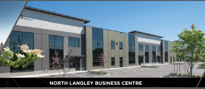
NORTH LANGLEY BUSINESS CENTRE