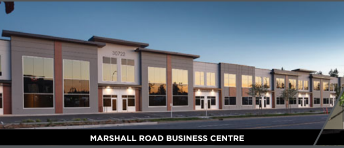
MARSHALL ROAD BUSINESS CENTRE