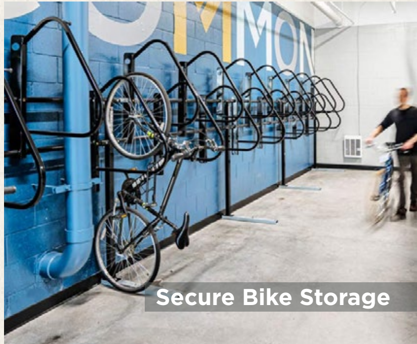
Secure Bike Storage