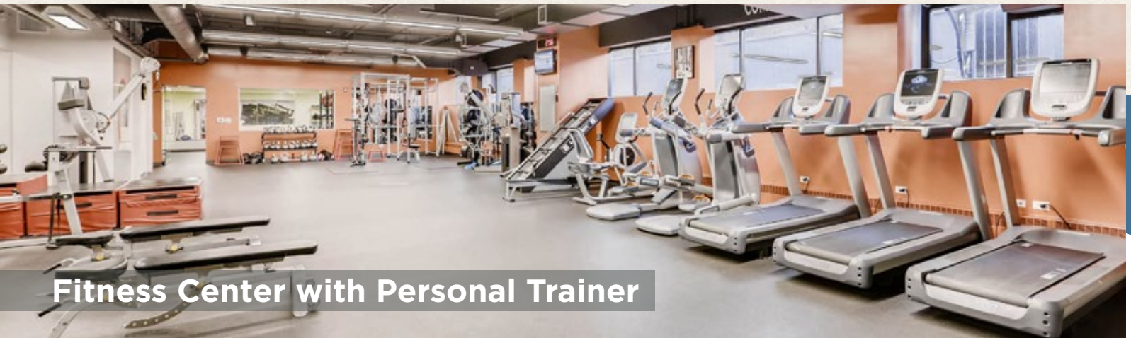
Fitness Center with Personal Trainer

Security Guard on-site M-F, 11:00AM to 7:00PM.