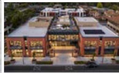
1540 EL CAMINO REAL