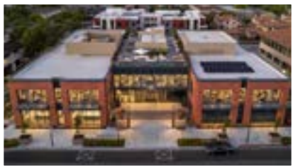
1540 EL CAMINO REAL