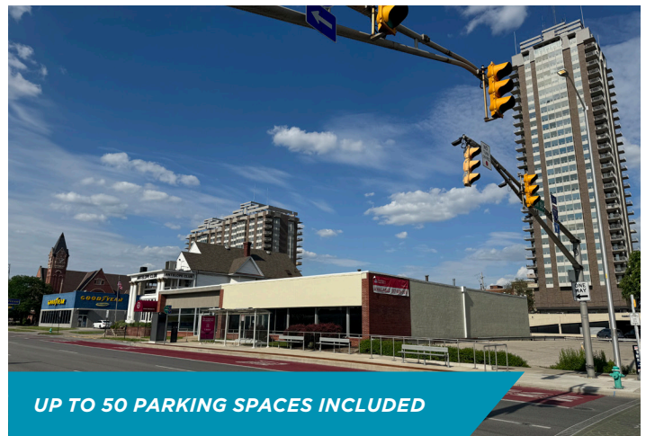
UP TO 50 PARKING SPACES INCLUDED