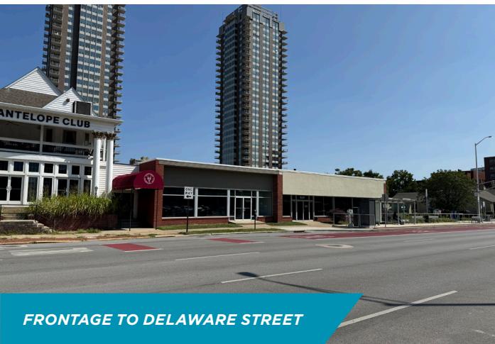
FRONTAGE TO DELAWARE STREET