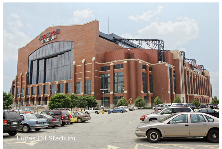
Lucas Oil Stadium