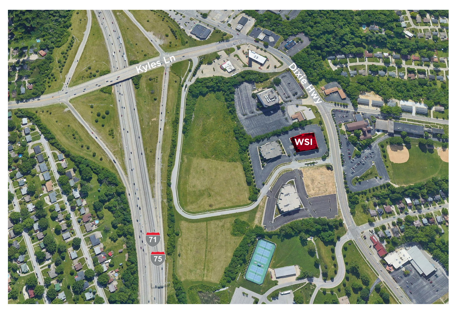
©2024 Cushman & Wakefield. All rights reserved. The information contained in this communication is strictly confidential. This information has been obtained from sources believed to be reliable but has not been verified. No warranty or representation, express or implied, is made as to the condition of the property (or properties) referenced herein or as to the accuracy or completeness of the information contained herein, and same is submitted subject to errors, omissions, change of price, rental or other conditions, withdrawal without notice, and to any special listing conditions imposed by the property owner(s). Any projections, opinions or estimates are subject to uncertainty and do not signify current or future property performance.