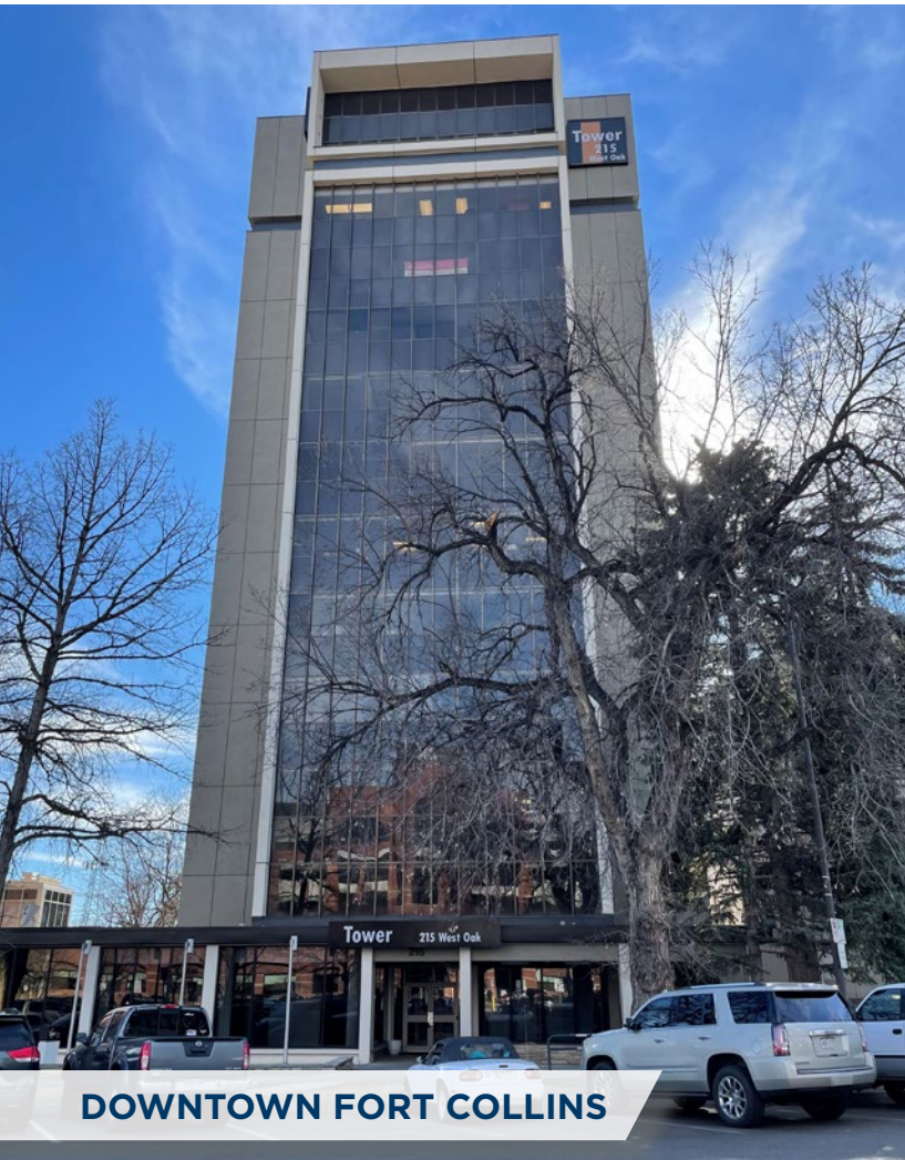
DOWNTOWN FORT COLLINS

9TH FLOOR | FORT COLLINS, COLORADO 80521