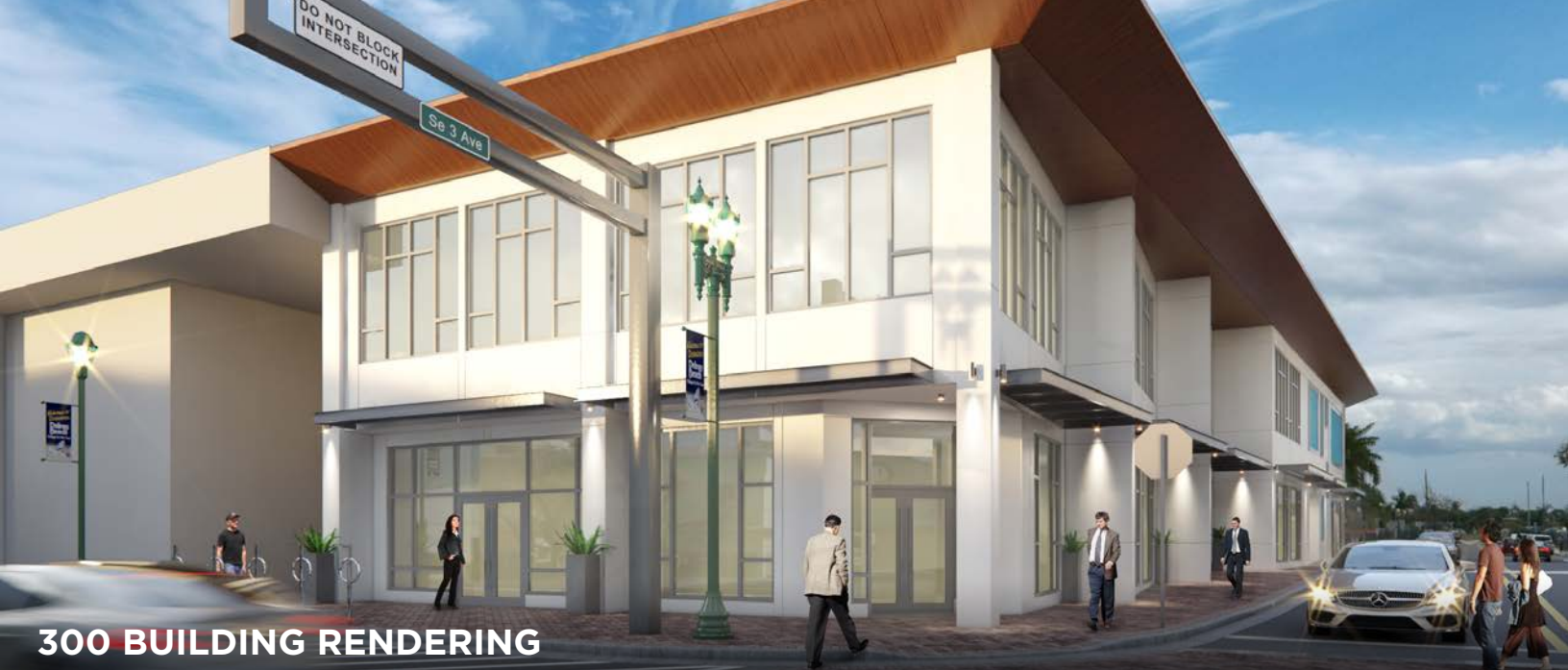
300 BUILDING RENDERING