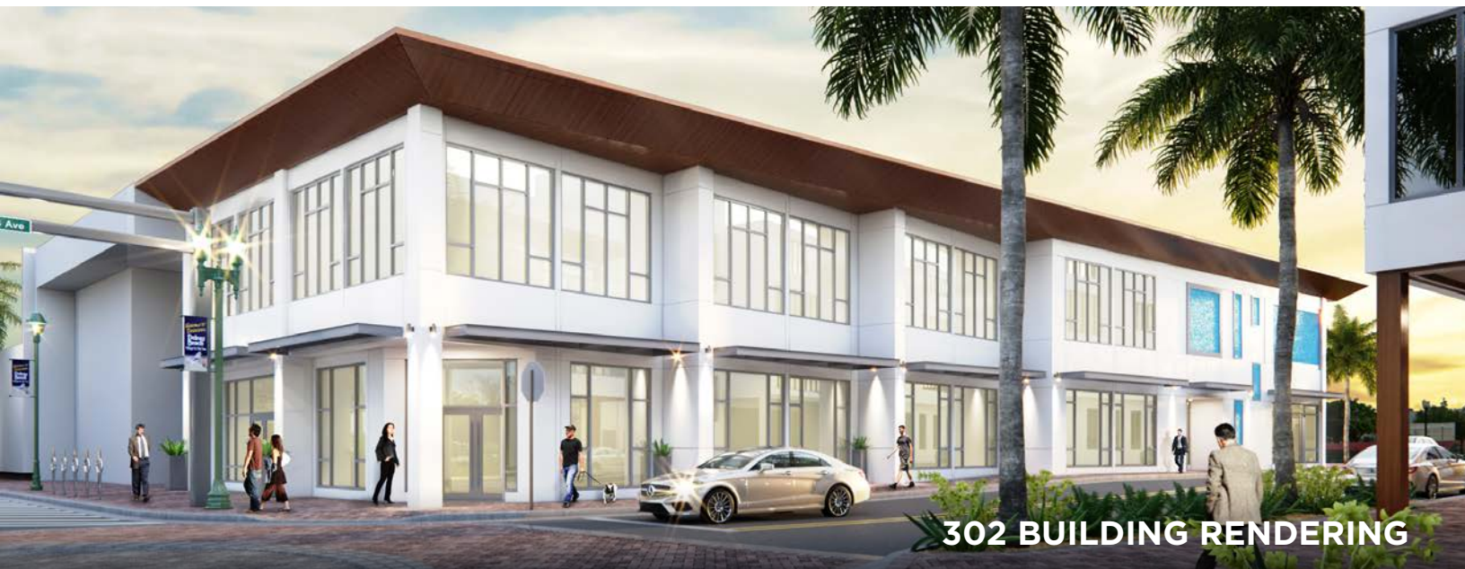
302 BUILDING RENDERING