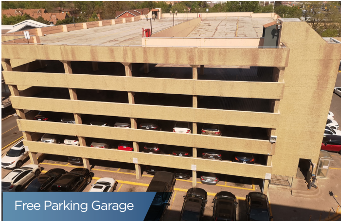
Free Parking Garage