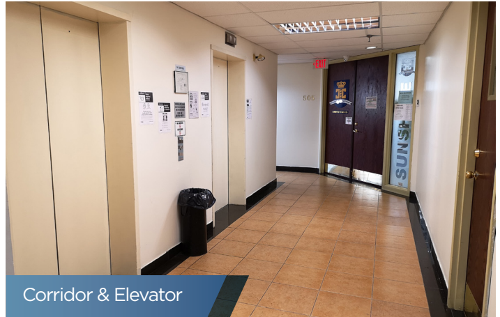
Corridor & Elevator